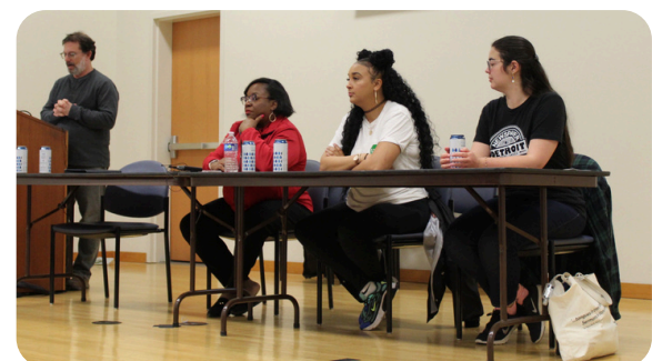
Growing Conference and Events to Build Educational and Networking Opportunities