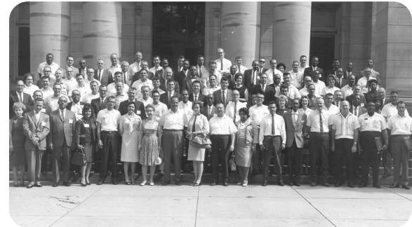
Building on Over 60 Years of Labor Education to Inspire Next Generation Leadership