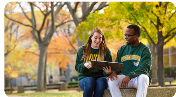
Strengthen Academic and Research Programs