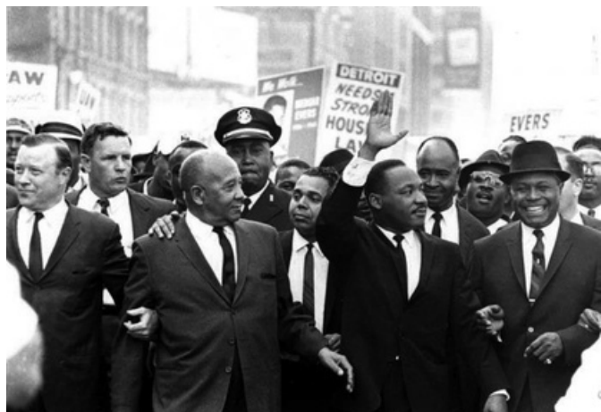
MLK Jr and Walter Reuther at March in Detroit 1963

Learn the best practices when representing workers who have been disciplined or discharged. In this class, evaluate whether discipline is "just", learn what to look for during the disciplinary investigation, how to contest disciplinary actions, and much more to protect workers' rights and ensure a fair process.